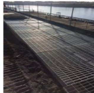
Grating secured - note overlap