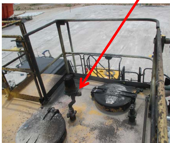
Figure 2: View of burnt breather vent and the setting of the diesel ball float valve in the support bracket.