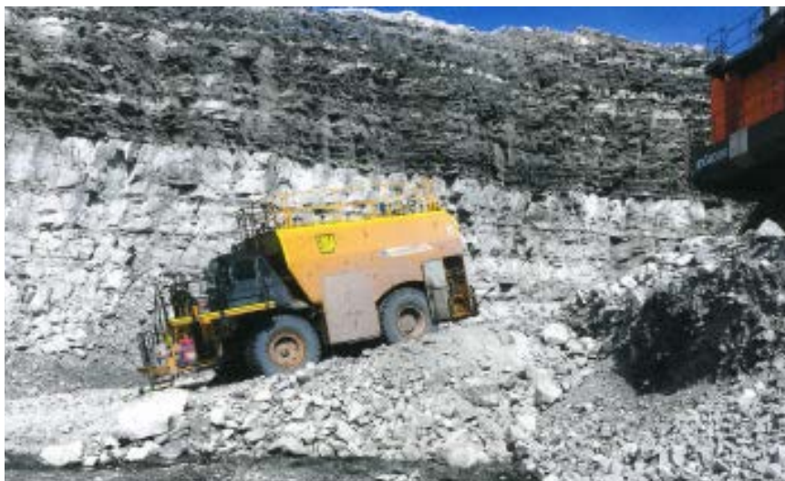
Figure 1: View of the fuel service truck on the ramp after the fire.