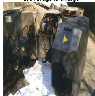
Overtuned Roller 2