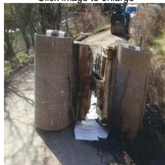
Overtuned Roller 1