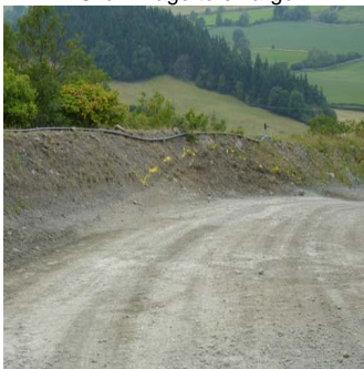
Yellow Paint Highlights Outer Wheel Path