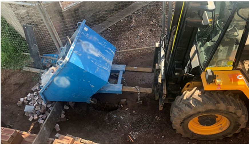
Image 1: The forklift tines were not fully inserted into the bin pockets.

A worker received serious crush injuries when a self-dumping bin full of building rubble tipped forward onto his leg. The worker was standing in front of the bin when it tipped forward.