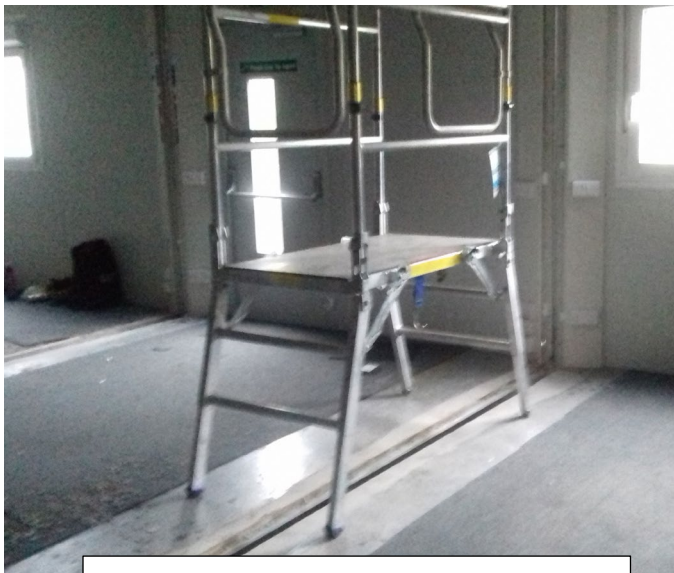
Fig. 1 – position of the single person elevated delta deck, showing exposed gap between the two modular cabins

15.10.2020 a RIDDOR – Specified Injury incident occurred on the first floor of the former office building, M23 SMP Godstone Compound. The IP, who was working for subcontractor on behalf of modular building provider, was removing a ceiling cover trim standing on a delta platform which was positioned over the exposed floor gap. When stepping down from the platform the IP stepped into the exposed floor gap coming off the platform steps and twisted his ankle. Following an X-ray, the IP was diagnosed as having a fractured ankle.