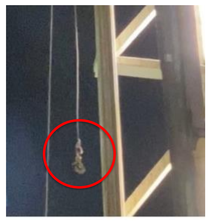
Post incident - safety hook was found open