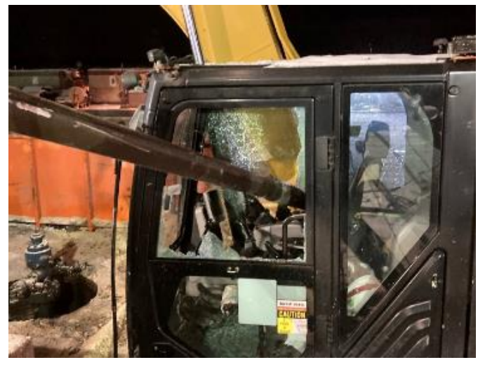
Final position of the HWDP