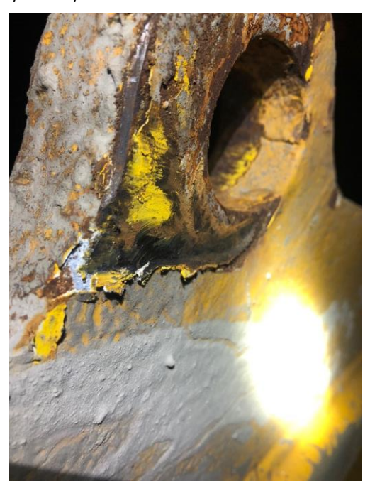
Figure 4. Gouge marks on face of workbox locking pin receptacle