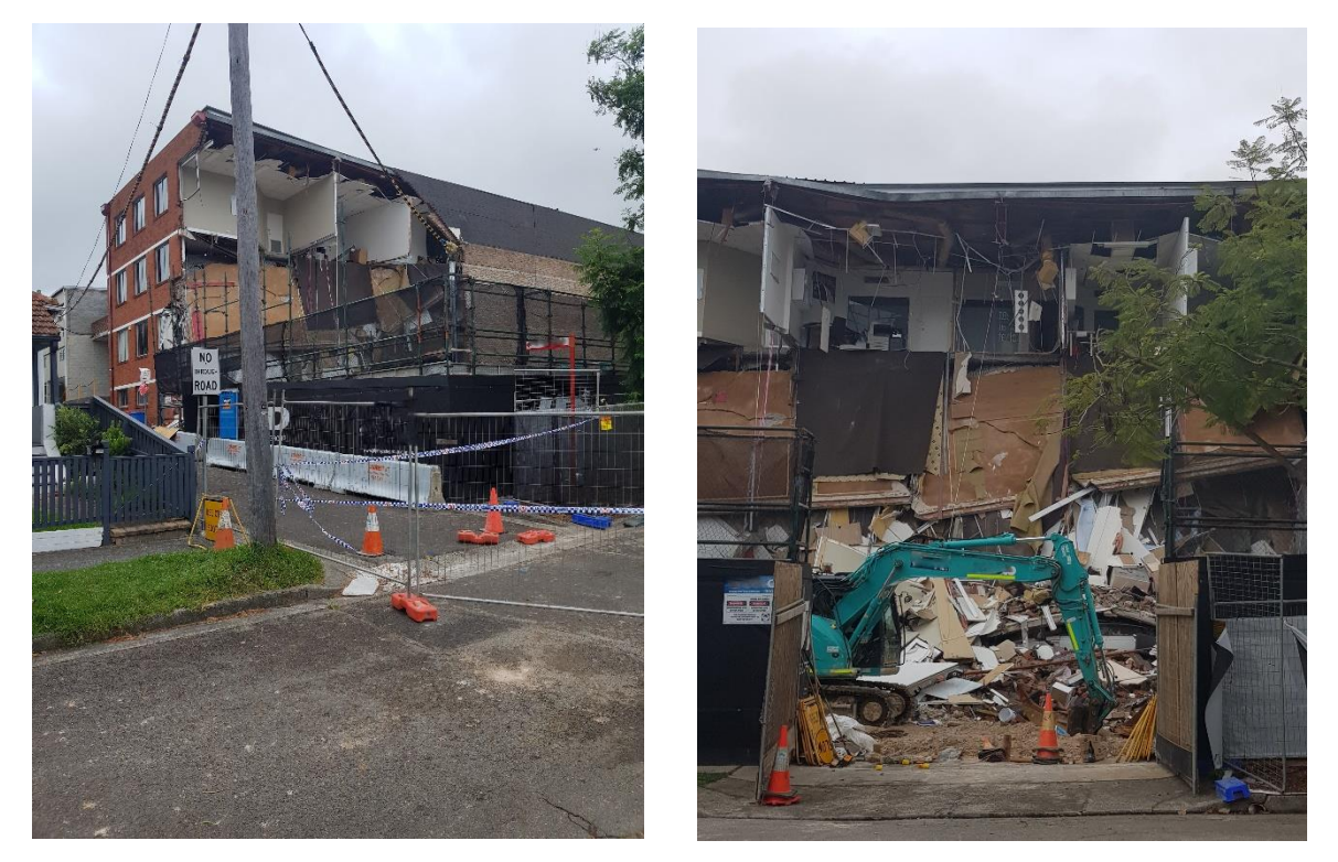
The site of the collapse

A building in Crows Nest partially collapsed after excavation work had been undertaken at an adjacent construction site. Workers were completing steel fixing and formwork for a capping beam when they observed cracking and evacuated the site before the collapse. Fortunately, no workers or members of the public were injured.