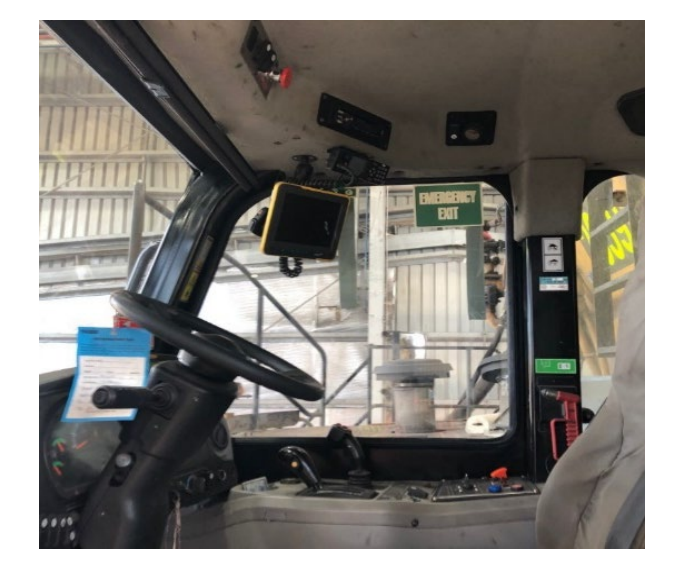
Figure 4. Cabin of water cart (incident 2)