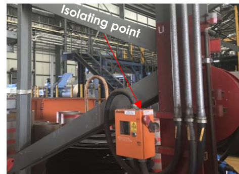
Figure 2. Isolation point (location for personal locks)