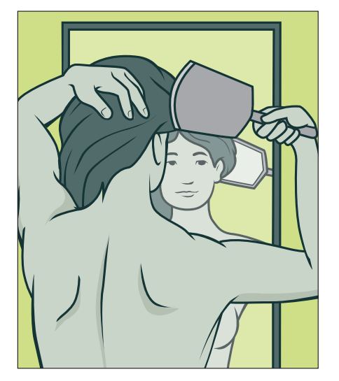
4. Use a hand-held mirror or ask an appropriate person (such as a hairdresser or barber) to check your head and neck. This includes: eyelids, ears and scalp.