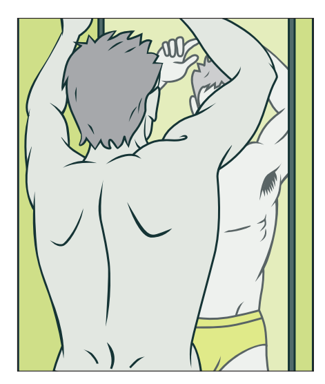
1. Stand undressed in front of a mirror. Raise your arms and check your front and back, and left and right sides.

Examine your skin carefully. Look for new growths or existing moles or spots that have changed in size, shape, colour or texture. Pay attention to sores or spots that do not seem to heal and spots that look different to other nearby spots. Report any suspicious or different looking moles, spots or sores to your doctor.