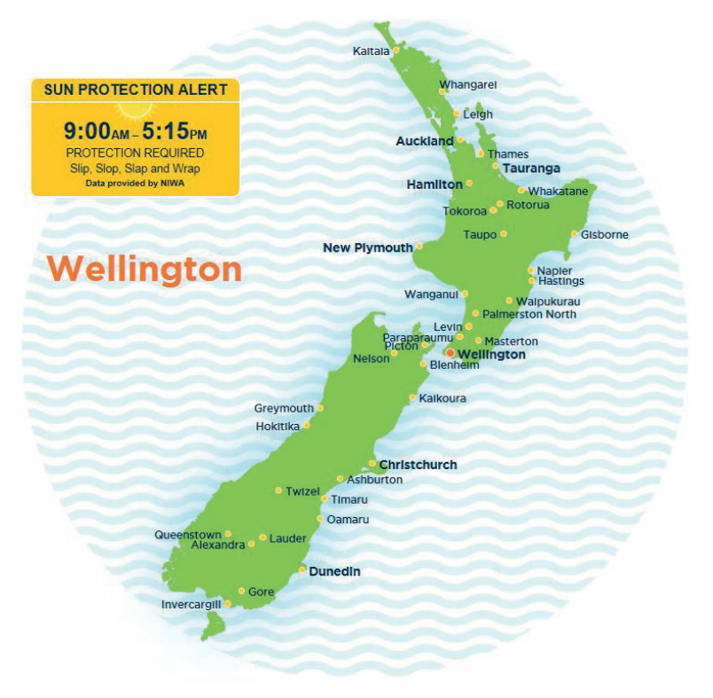
FIGURE 3: Sun protection alert

UV radiation levels can vary significantly across seasons, and throughout the day. Without a tool (such as uv2Day ) that shows the levels of UV radiation, workers cannot tell what the UVI will be at any time or place.