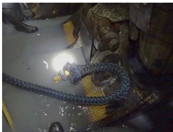
Figure 2: The 35t WLL bow shackle and blue Amsteel® rope on the roof support pontoon

Shortly after the load was applied to the towing assembly by the shearer, the Rud link failed, the bow shackle and rope recoiled back towards the three workers located at the maingate. The bow shackle struck the shearer operator on the lower right leg. The connection point on the shearer was located approximately 22metres (15 roof supports) from where the injured shearer operator was located.