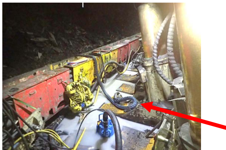
Figure 1: Location of worker struck by the recoiling shackle and blue Amsteel® rope

A shearer operator was injured in the process of releasing a jammed armoured face conveyor (AFC) chain using the shearer on a longwall. The injury occurred when an eight-tonne working load limit (WLL) Rud link, located on the shearer ranging arm, failed due to overload. The shearer operator was hit on the leg by recoiling components of the tow rope assembly when the Rud link failed. The worker was in the roof support walkway at the maingate end of the longwall, approximately 22 metres (15 roof supports) from the failed connection point on the shearer.