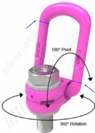
Figure 3: Similar Rud bolt on lifting point. Location of fracture indicated by blue arrows