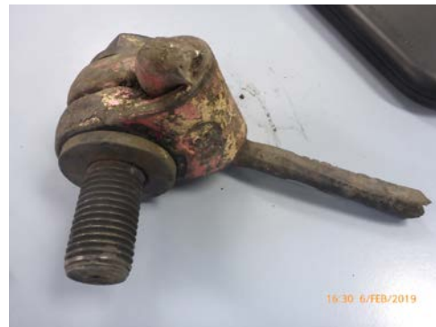
Figure 4: The failed incident 8t Rud link