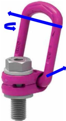
Figure 5: Direction of loading to cause deformation observed