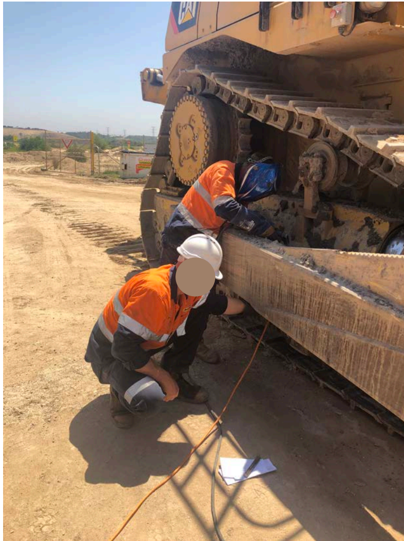
Figure 2: Re-enactment of assistant suffering an electric shock. (IncNot0033402).

A fitter had washed down a dozer in a sand mine and was preparing to weld. Another worker saw the fitter positioned awkwardly so went to assist. After getting a welding glove, he held a pipe in place. The worker felt a tingle up his arm when the fitter struck the arc.