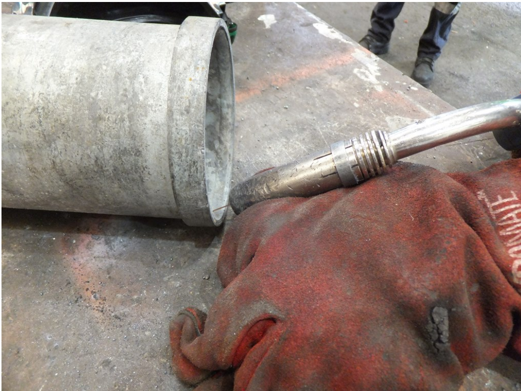
Figure 1: Shock while welding pipe. (IncNot0033939).

A worker was using a MIG welder in a surface workshop of an underground coal mine. The worker rested the handpiece tip on his gloved hand to steady the handpiece. The worker then felt a shock in his left hand.