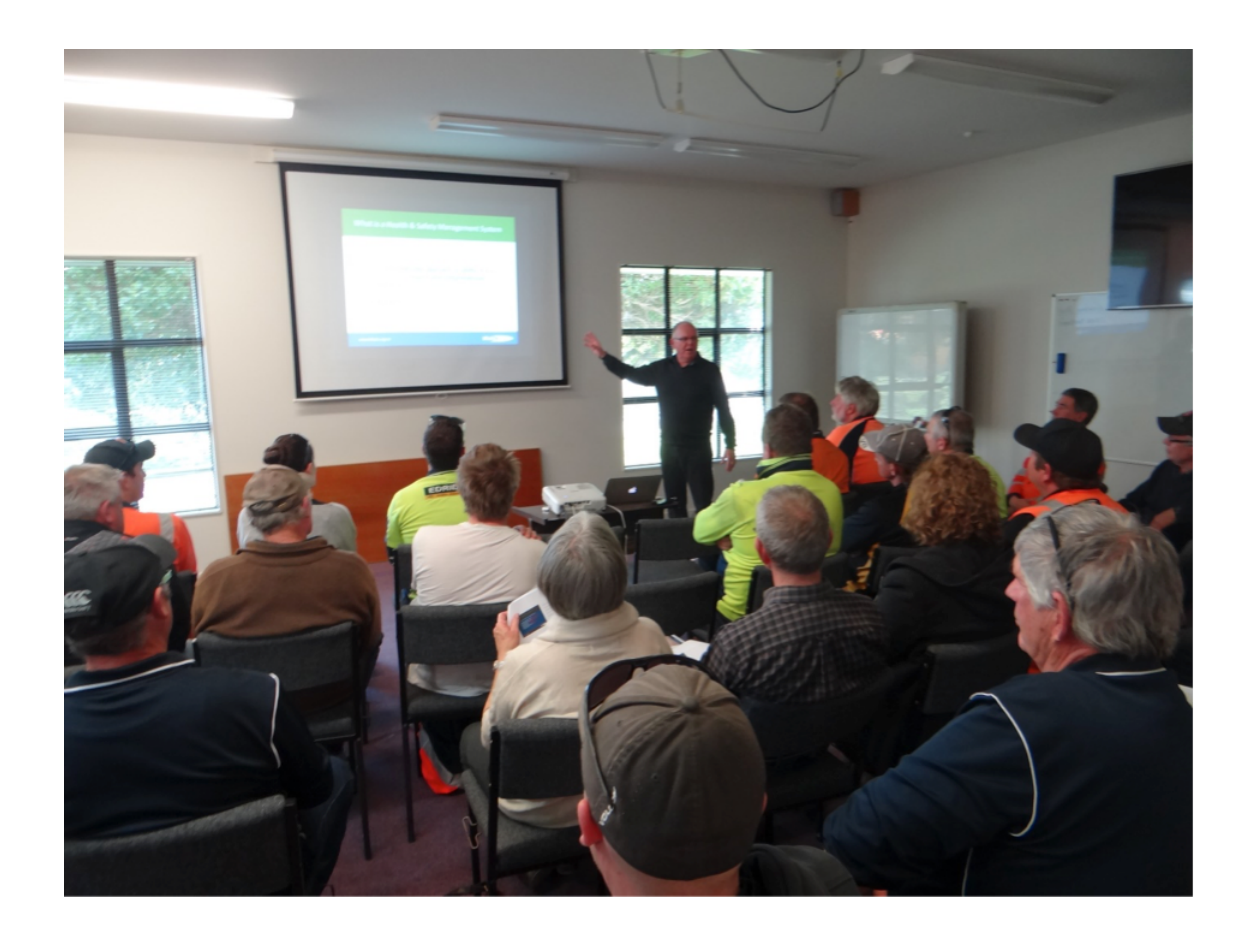
We had nearly 30 attendees across the two sessions including people who

I was in Blenheim last week for the latest of our 17 planned Regional forums.