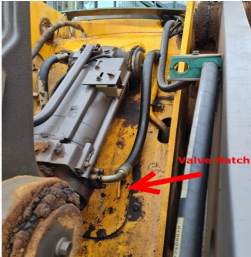
Fatal injury during hydraulic hose repair