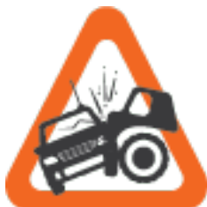
Roads or other vehicle operating areas

Dangerous incident IncNot0037659 Open cut coal mine