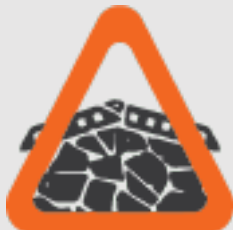
Ground or strata

Dangerous incident IncNot0037650 Underground metals mine