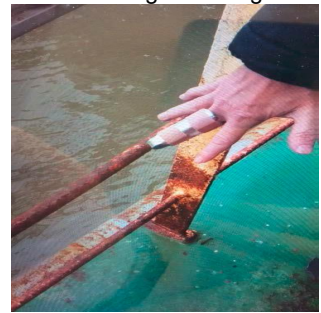
Click image to enlarge