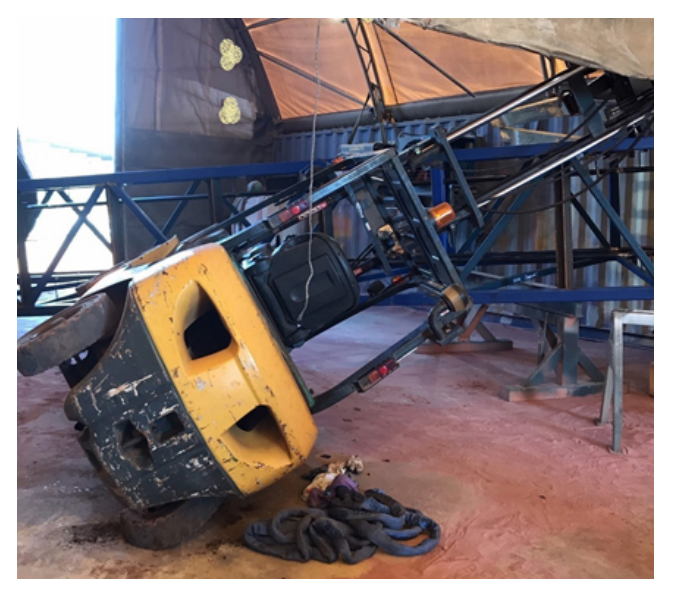
Image 2: The momentum of the jib tipped the second forklifts sideways.