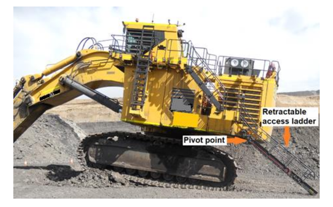
Figure 1 - Excavator with retractable ladder

An operator was fatally injured when he became entangled between the movable part of an excavator's access ladder and the wall of the engine room. (See Figure 1).