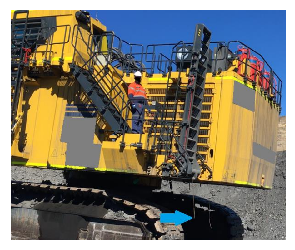
Figure 5 - Pull-chain for the ladder emergency release valve