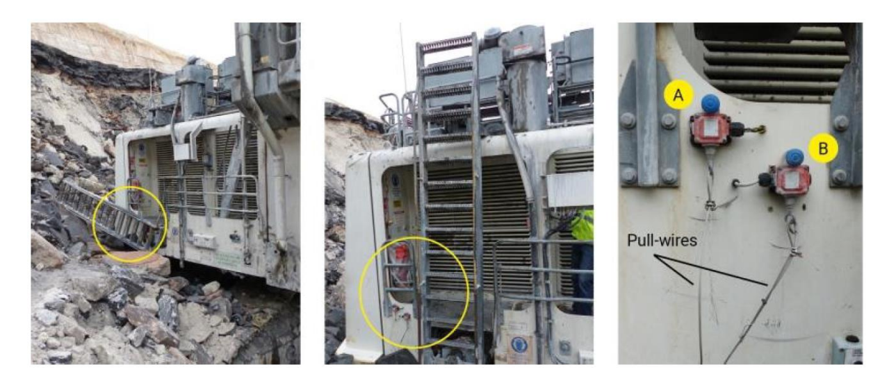
Figure 6 - Scene of fatality caused by shovel hydraulic access ladder