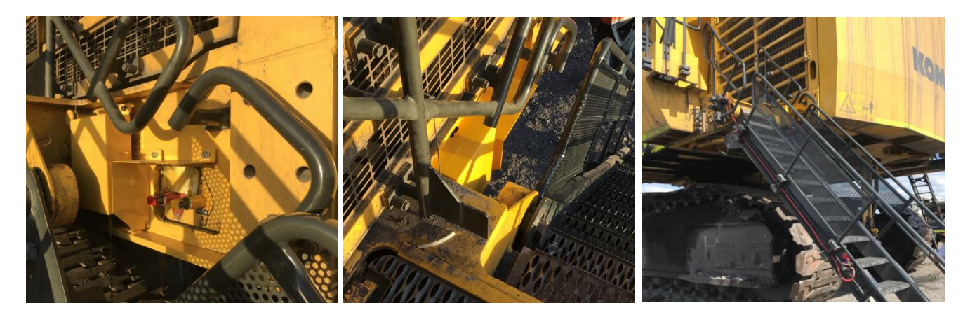
Figure 4 - Covers and inserts fabricated after the incident

The excavator involved in this incident was subsequently modified. Mesh inserts were installed on the rotating handrails to prevent persons accessing the E-Valve and covers were installed over the E-Valve. (See Figure 4)