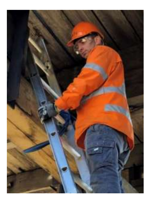
Figure.2 Ladder tied off with 1m overhang at top